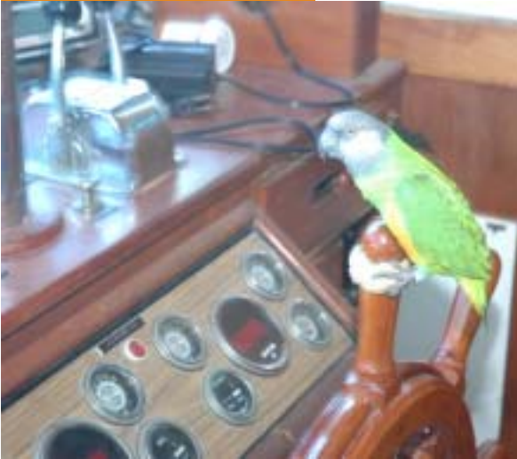
Indie takes a turn at the helm.

"Indie" travels with us wherever we go, by car or boat. He is a two-year-old Senegal Parrot and is just starting to talk. He greets us with a "Hi!" when we come aboard, and is learning "Be right back!" when we leave. Upon reaching maturity Senegals have about a 200-word vocabulary. Indie is potty trained and with that milestone complete, he has earned the right to sit on my shoulder. He has spent the day at work with me at West Marine where he is a delight among the customers.